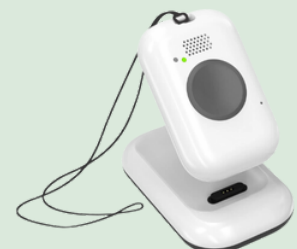
On the Go

includes an advanced GPS locator so that you can quickly get the help you need in your home or on the go 24/7 along with automatic fall detection.