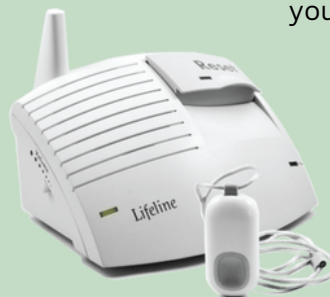
HomeSafe with Auto Alert

Can automatically call for help if it detects a fall even if you can't push the button yourself.